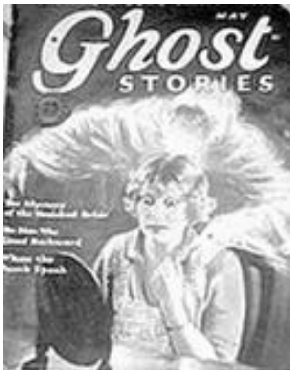
Cover of the magazine, Ghost Stories, May 1927, Vol. 2, No. 5; Constructive Publishing; Wikimedia Commons.

It had long been thought that the mirror had been made in Europe, but recent analysis has shown that the obsidian comes from Pachuca in Mexico, and the mirror was crafted by the Aztecs. Following Helen's talk there was much discussion about the mirror and absolutely everyone wanted to see the original page in the scrapbook!