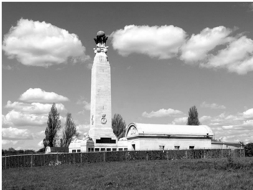
The Chatham Naval Memorial, taken in 2015