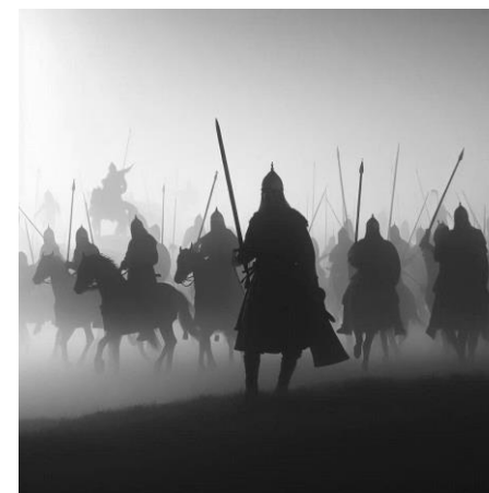
The Battle of Ellendun, AD825 imagined by AI

2025 marks the 1200th anniversary of one of the most historically consequential and significant battles that shaped the story of Medway, Kent, and, more broadly, the unification of England. The Battle of Ellendun in AD825 was a pivotal victory for the Kingdom of Wessex over the Kingdom of Mercia. Wessex was led by King Egbert (r. AD 802–839), who was Alfred the Great's grandfather, while Mercia was led by King Beornwulf (r. 823–826).