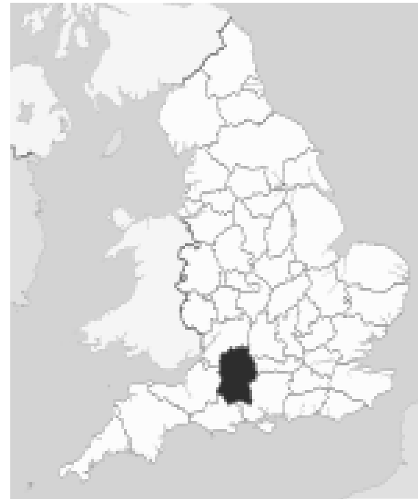
The location of Wiltshire.

Swanton, M. (ed.) (1996) The Anglo-Saxon Chronicles . Translated by M. Swanton. London: Phoenix Press.